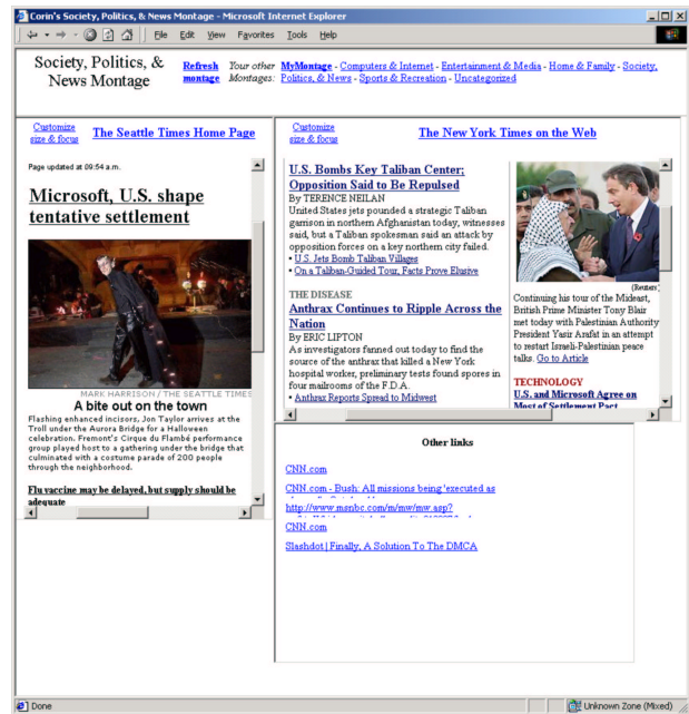
Figure 2: A topic-specific montage. This montage embeds content from several pages.