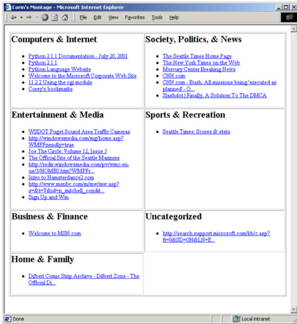
Figure 3: A links-only montage.

value of a page, I(p)^{k_1} \times S(p)^{k_2} . If we assume the cost of displaying uninteresting content to be zero, then the expected utility of a page is the product of the probability the user will visit the page given the current context, Pr(p|\mathcal{C}) , and the value of the page. Thus, we take as the expected utility of a page: