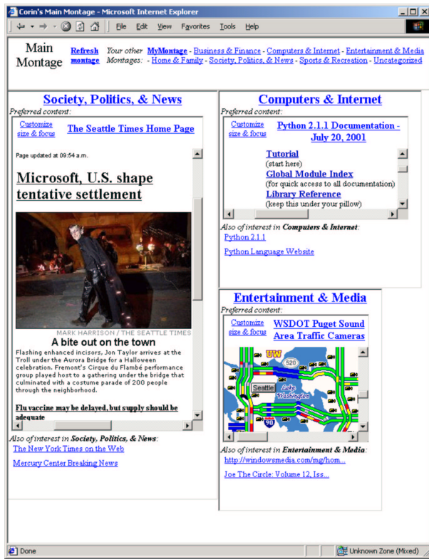
Figure 1: Main montage. Content is grouped by topic, and each topic heading links to a topic-specific montage.

a static topic ontology 1 . We took as the topic of a page the most likely category.